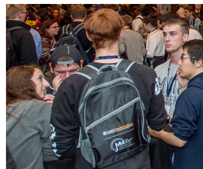
Meeting Tote Bags