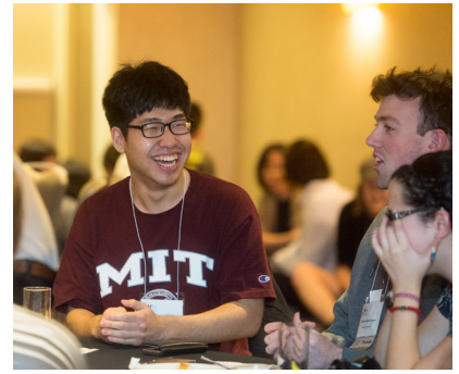
Graduate Student/First Timers Reception