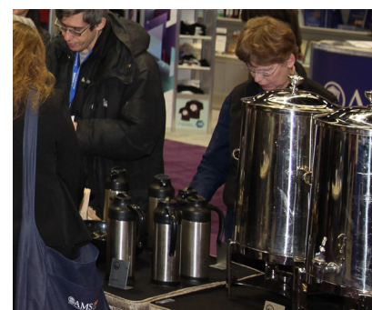
Coffee in the Exhibit Hall