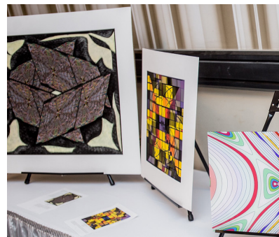
Mathematical Art Exhibit