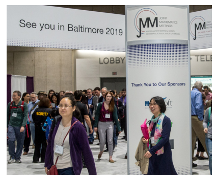
Crowd Coming into the Exhibits in San Diego