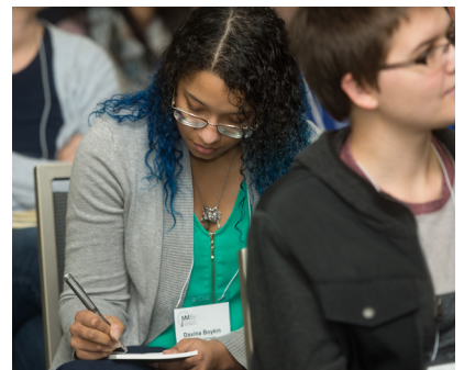
Notepads and Pens