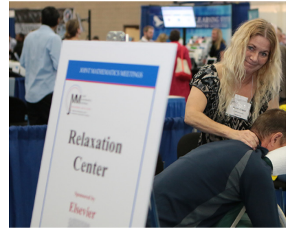
Relaxation Center in Exhibit Hall