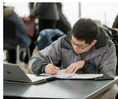
Notepads and Pens