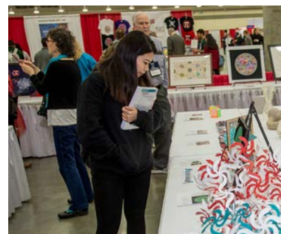
Mathematical Art Exhibit