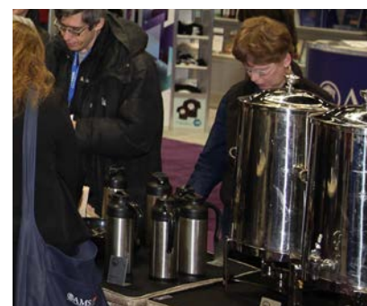
Coffee in the Exhibit Hall