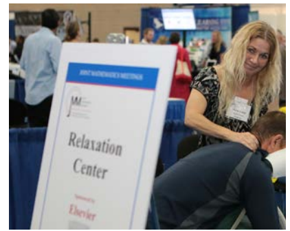
Relaxation Center in Exhibit Hall