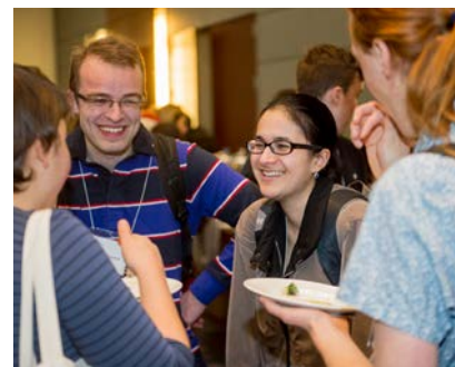
Graduate Student/First Timers Reception