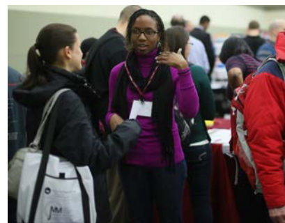
Meeting Tote Bags